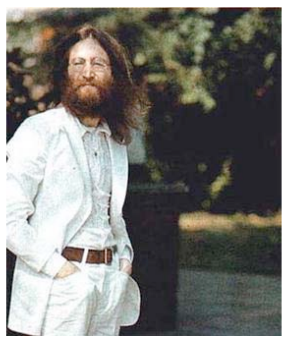
Figure 7: John Lennon Photograph from the Abbey Road album. Notice the difference between this photo and his image in Fig. 6

Some in-game songs are from a time period during which the Beatles gave up playing live. For these songs, Lennon, McCartney, Harrison and Starr are shown in the recording studio, but these videos also tend to include extra animation. Sometimes the animation references Beatles movies like Magical Mystery Tour or Yellow Submarine . Other times it seems to be just a general reference to psychedelic 60s nostalgia, with very bright colors and kaleidoscopic patterns of little discernible meaning ( Figures 8 and 9 ). These images arguably fit both the popular idea of the