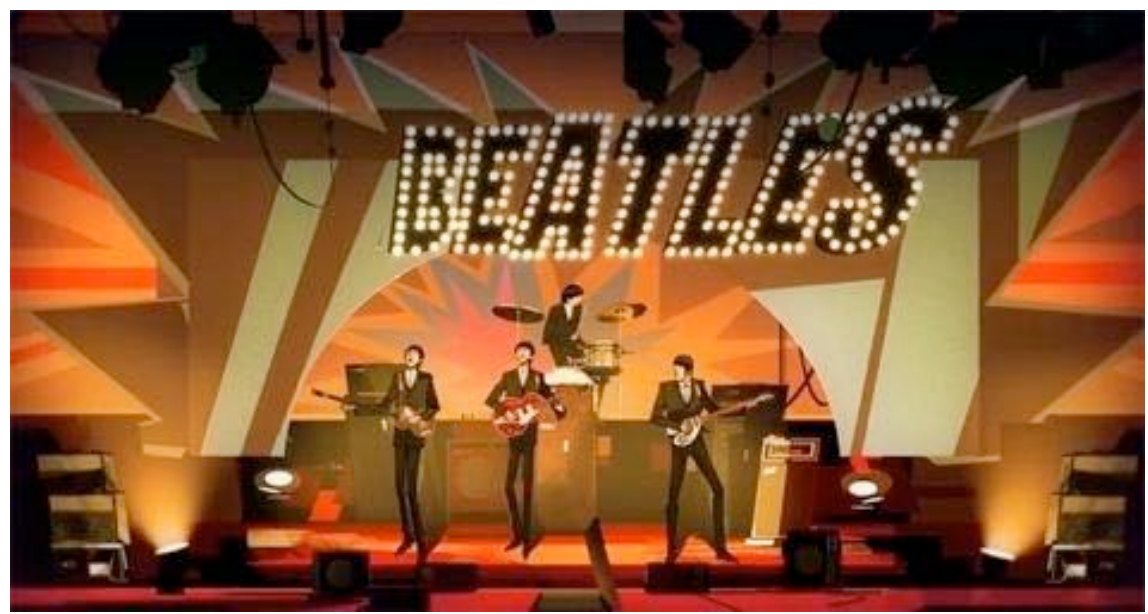
Figure 1: A still from the opening cinematic portraying the Beatles on the Ed Sullivan Show

garden on the head of a giant elephant that seems to reference the Hindu god Ganeshsa ( Figure 3 ). The Ganesh-Elephant is leading a crowd of marching 'eggmen' and 'elementary penguins', a cartoony reference to the song "I Am the Walrus". Finally, the Ganesh-Elephant/Beatle transport system marches to the edge of a cliff and the procession stops with the four Beatles standing proudly on top of the Ganesh-Elephant with their hands raised. This entire sequence occurs to a medley of parts of the following songs (in order): "Twist and Shout", "Hard Days Night", "Paperback Writer", "Here Comes the Sun", and "I am the Walrus".