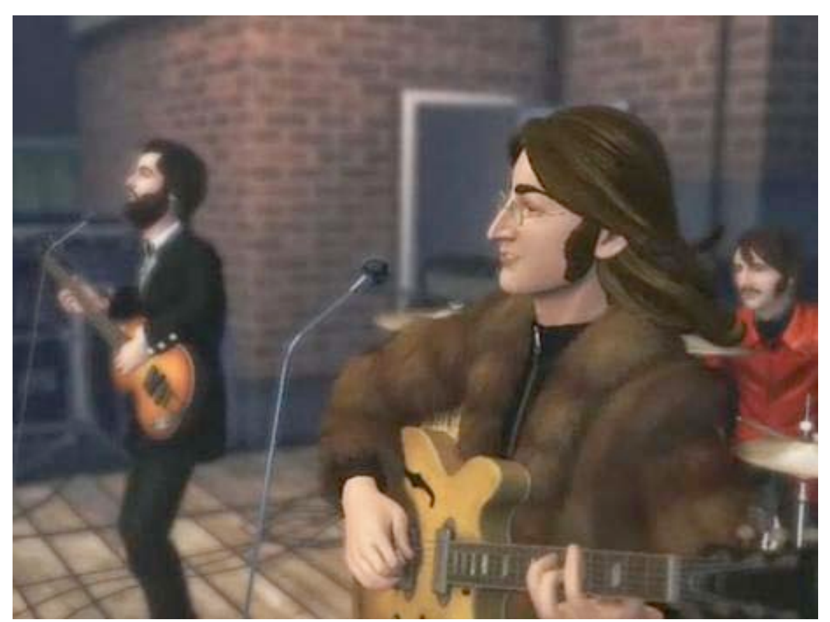
Figure 5: A still from late in the game depicting the Beatles on the rooftop of the Apple corps building.