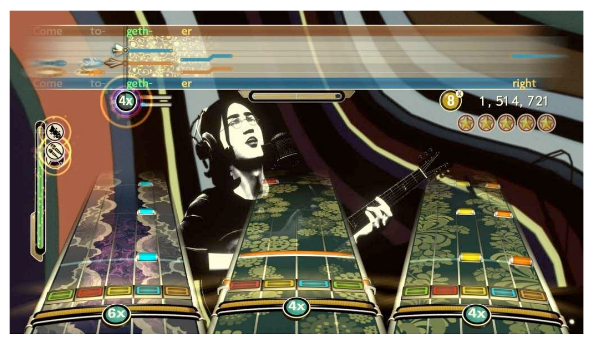
Figure 6: A still from the "Come Together" video