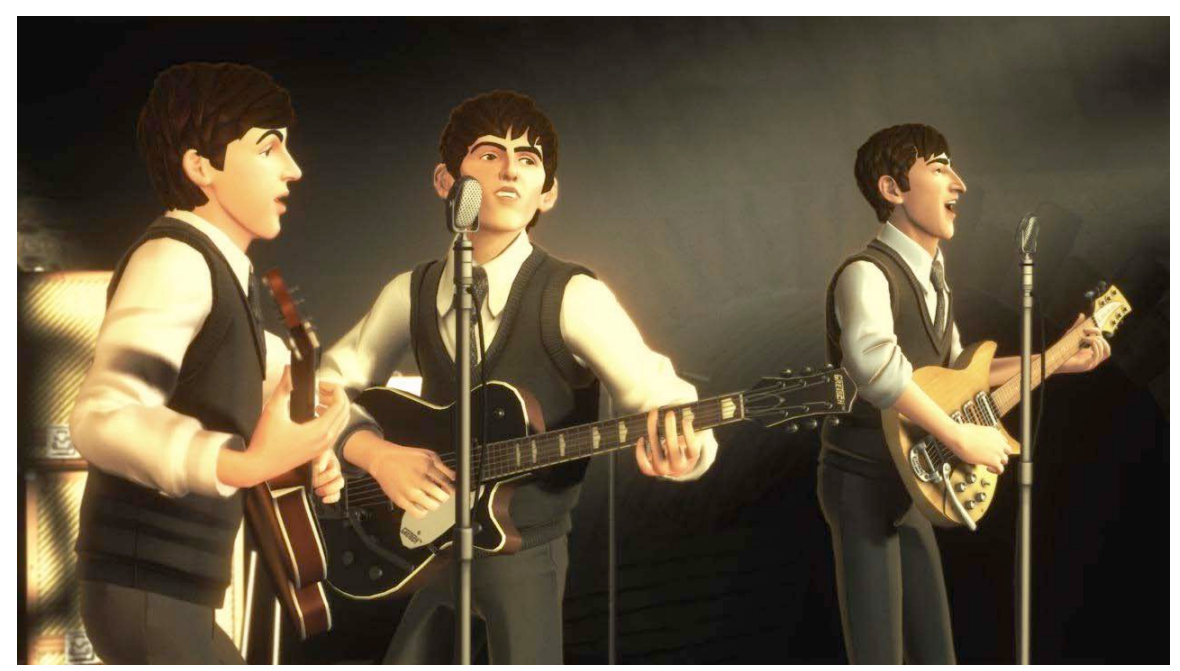
Figure 4: A still from early in the game depicting the Beatles playing the iconic Cavern club