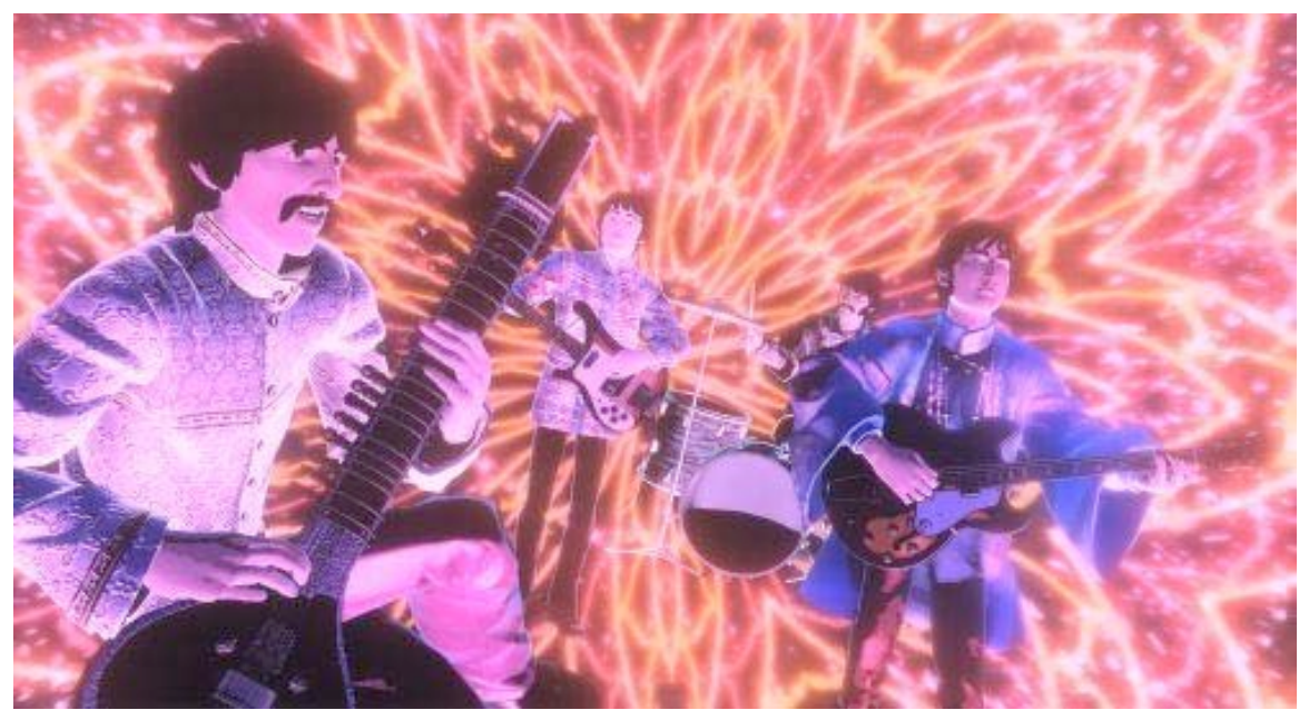
Figure 9: A psychedelic still of the Beatles Playing together in the remixed song "Within You Without You/Tomorrow Never Knows"