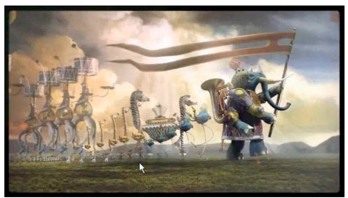
Figure 3: A still from the opening cinematic depicting the large elephant, eggmen, and elementary penguins.

When a person plays Beatles Rock Band , he can choose to sing up to three vocal parts, and/or he can play lead guitar, bass guitar, or drums. One to six people can play the game together, in the same room or remotely via the internet. As each song plays, a video plays that reflects an image of the Beatles that is appropriate for the look of the band at the time the song came out. For example, when a player chooses to play the track "Twist and Shout," she is shown an accompanying video of a very young looking Fab Four playing in a digital representation of the famous Cavern club ( Figure 4 ). However, when a player chooses to play "Get Back", a song released shortly before the band broke up, she is shown a video of the Beatles with longer hair, playing on the roof of the Apple corps ltd. building ( Figure 5 ). Notably, no in-game representation of the Beatles depicts a scruffy circa 1969 version of the band. In-game representations of the Beatles are kept mostly clean-shaven throughout the portrayed history ( Figures 6 and 7 ).