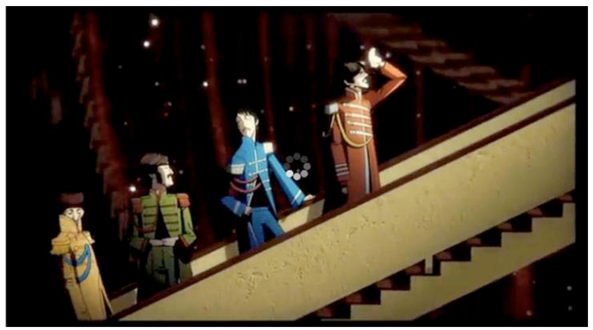
Figure 2: A still from the opening cinematic showing the Beatles in their Sgt. Peppers costumes.