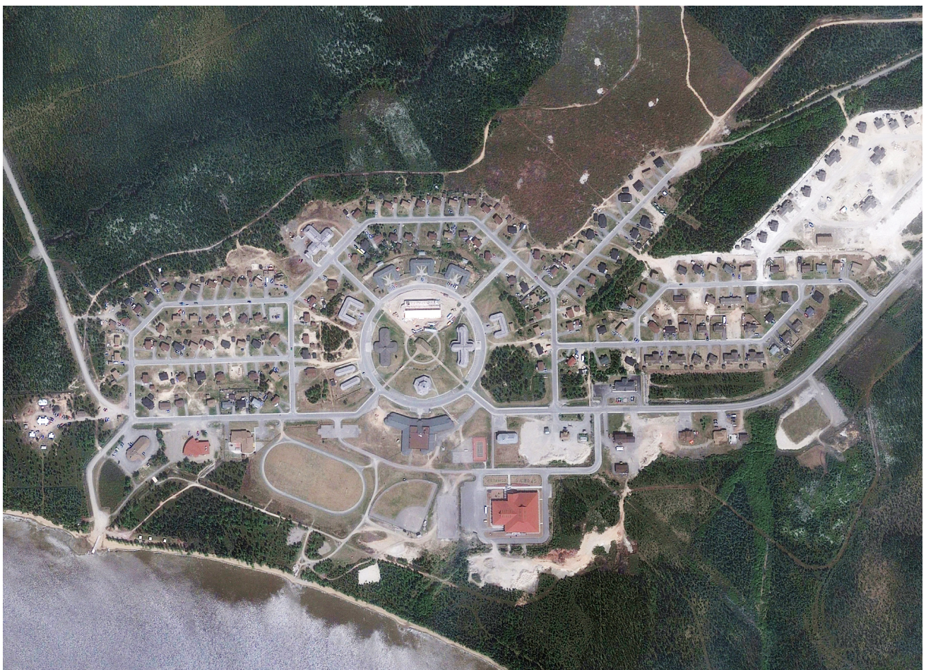
Figure 3. Oujé-Bougoumou, Quebec. Radial grid formed in the development of the new Oujé-Bougoumou community.