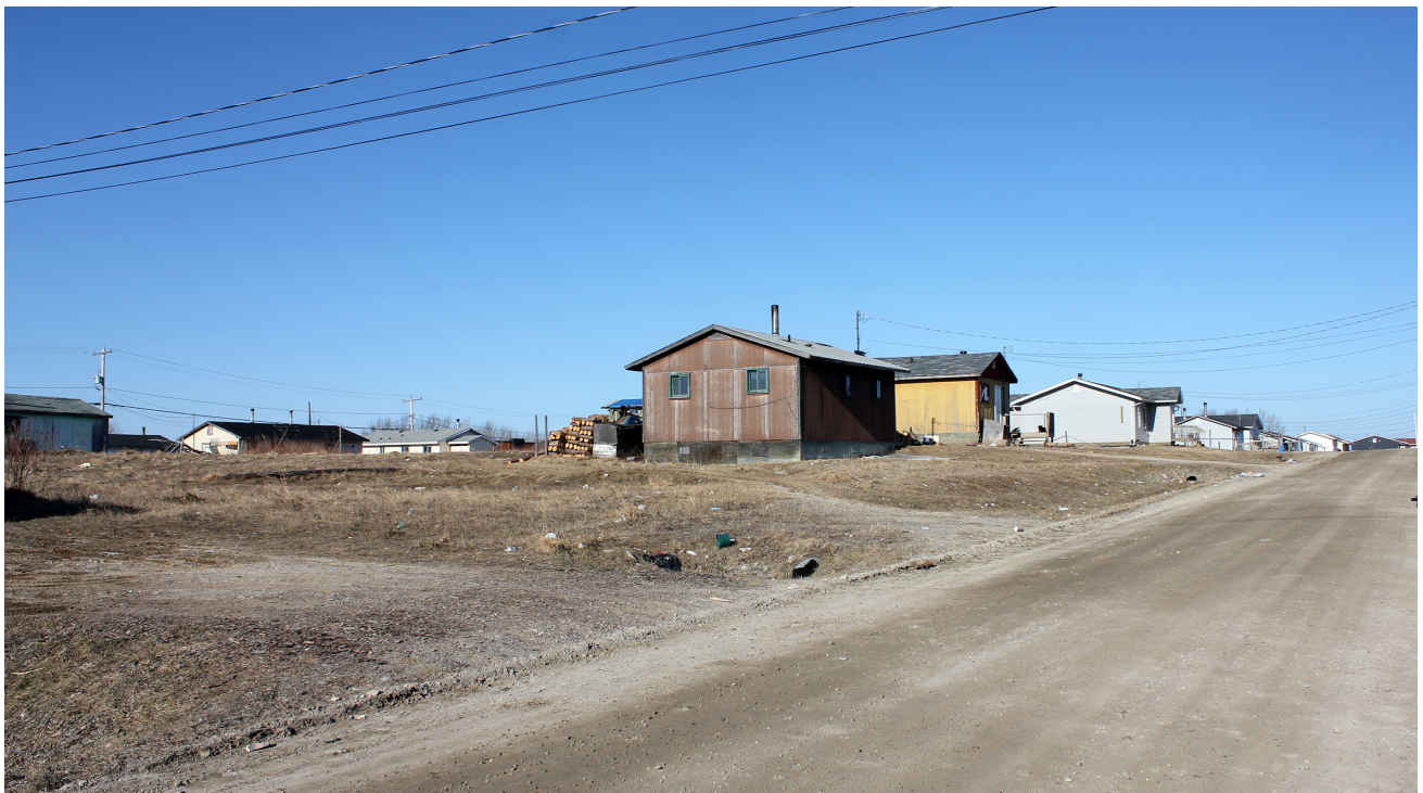
Figure 2. Eabametoong First Nation. Typical ‘suburban’ streetscape of a mid-Canada corridor First Nations community.

Capitalizing on the role of the planner in the implementation of housing systems, we sought possible in-