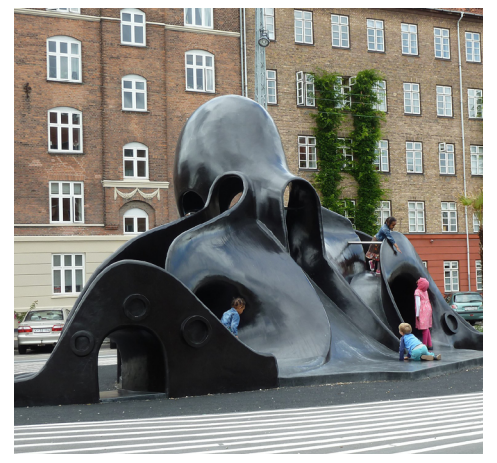
For the full story, contact information, and related resources, see the <u>Good Idea profile at Cities</u> of Migration

An urban regeneration project re-imagines a city park as a space for living in diversity