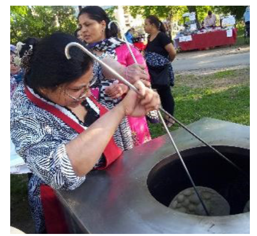
For the full story, contact information, and related resources, see the <u>Good Idea profile at Cities</u> of Migration

Reclaiming public space opens up economic opportunities for local women in Canada's most diverse neighbourhood