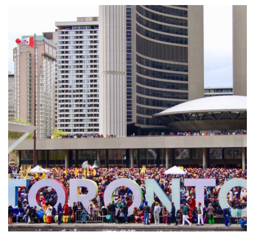
For the full story, contact information, and related resources, see the Good Idea profile at Cities of Migration

Equity-based planning brings people into the centre of city-building