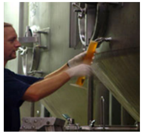
For the full story, contact information, and related resources, see the <u>Good Idea profile at Cities</u> of Migration

Land use and business assistance strategies to boost local economic development