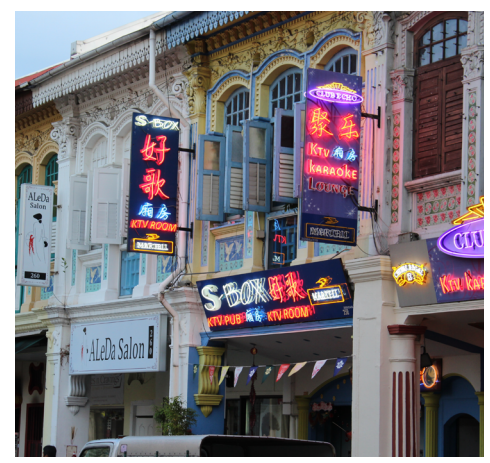
For the full story, contact information, and related resources, see the <u>Good Idea profile at Cities</u> of Migration

An urban renewal project revitalizes city neighbourhoods while reclaiming its multicultural past