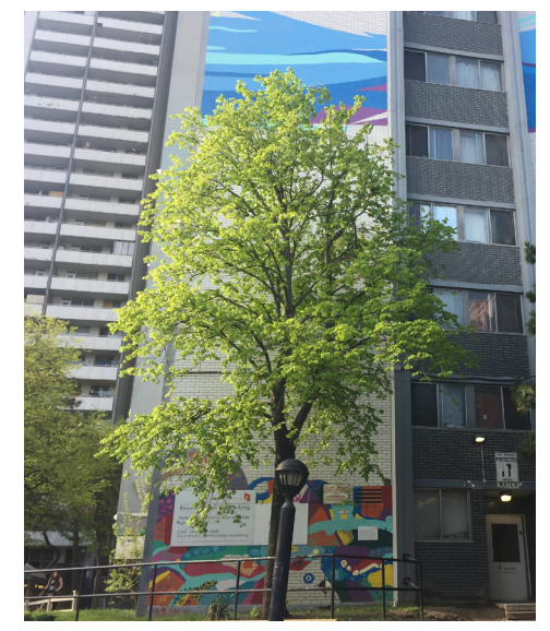
For the full story, contact information, and related resources, see the <u>Good Idea profile at Cities</u> of Migration

Soaring above a busy intersection, this community-led art initiative transformed a 32 story modernist social housing high-rise into a vertical canvas for the world's tallest mural. An enormous bird flies up the side of the building towards the sky. Emblematic of a phoenix rising from the ashes, the design includes a subtle reference to the six-alarm fire in 2010 that forced out over a thousand residents. The award-winning mural by artist Sean Martindale represents the new, more vibrant outlook the project hopes to bring to the building and surrounding area in one of Toronto's most densely populated neighbourhoods.