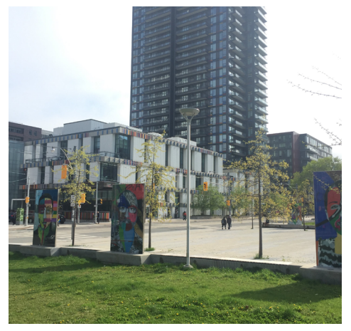
For the full story, contact information, and related resources, see the <u>Good Idea profile at Cities</u> of Migration

Designing for cultural and gender equity enhances openness, safety and accessibility at the community pool