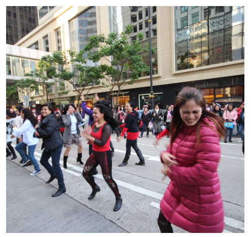
For the full story, contact information, and related resources, see the Good Idea profile at Cities of Migration

recreation and leisure in the city's public spaces