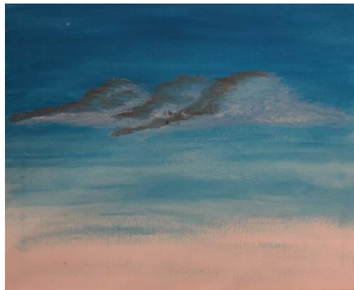
Illustration 4: made by JAKE

Lastly, I leave you with a lesson that was stated so eloquently and symbolically through JAKE's painting (see Illustration 4 ) of the resilience and optimism that Indigenous social workers still have even after enduring colonizing and patriarchal harm that Post-Secondary institutions place on them. JAKE stated, "So, you know, maybe these clouds will eventually build up into storm clouds, or maybe they'll just blow off one another into little clouds and then one day become water. So yeah, I think it represents just like a small little moment that can be looked at as nonsensical, and momentary, but could also mean something as time marches on." So as Mohawk Pine Tree Chief Joseph Brant stated during his last days in the physical world, "Let us continue free as the air" truthfully reconciling social work education in post-secondary institutions (Leduc, 2018).