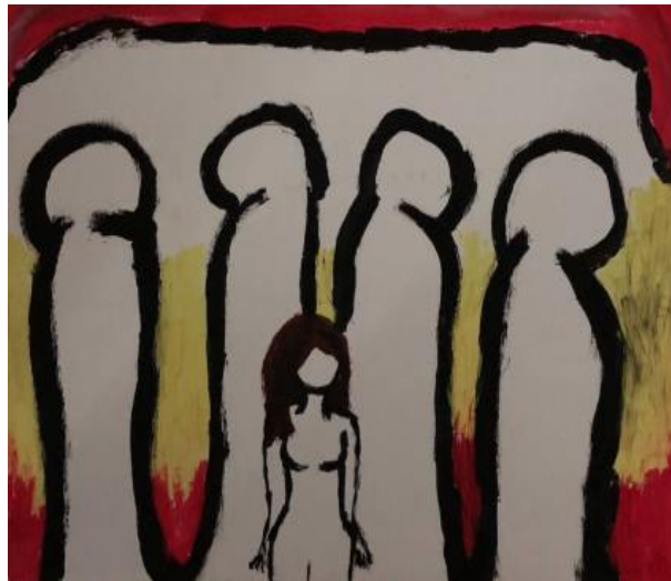
Illustration 3: made by JENNIFER

This was also found in Inspire (2018) study which found that, “Indigenous students were clear that they needed champions and allies who are knowledgeable and informed, both within their classrooms and across the university system. They needed these champions and allies to stand with them when they faced with barriers to inclusion” (p. 34).