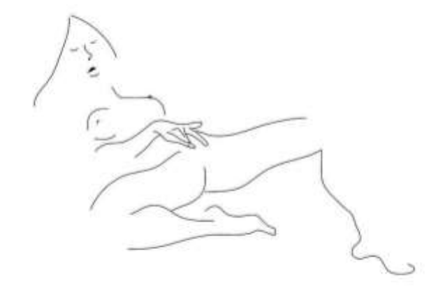
Figure 4 . Rupi Kaur untitled poem. From Instagram, by Rupi Kaur, 2018, https://www.instagram.com/p/Bg7l5pSjIyQ/?hl=en&taken-by=rupikaur_

Despite its provocative subject matter, the text alone in this poem is not enough to convey its message; instead, the poem is only complete when both text and image are present. The image might have been created after the words, but it is only when it is paired with the image that the text takes on meaning—as well as shock value, which has proved valuable in gaining Instagram followers (Giovanni, 2017). To echo McVee et al.'s (2009) findings, Kaur's diction is less powerful, and can hardly be considered a poem, when stripped of its images. Still, despite its multimodality, the poem by no means achieves Kaur's goal of causing an emotional reaction in the reader or causing the reader's "stomach to turn" (CBS News, 2018). Of course, not all of