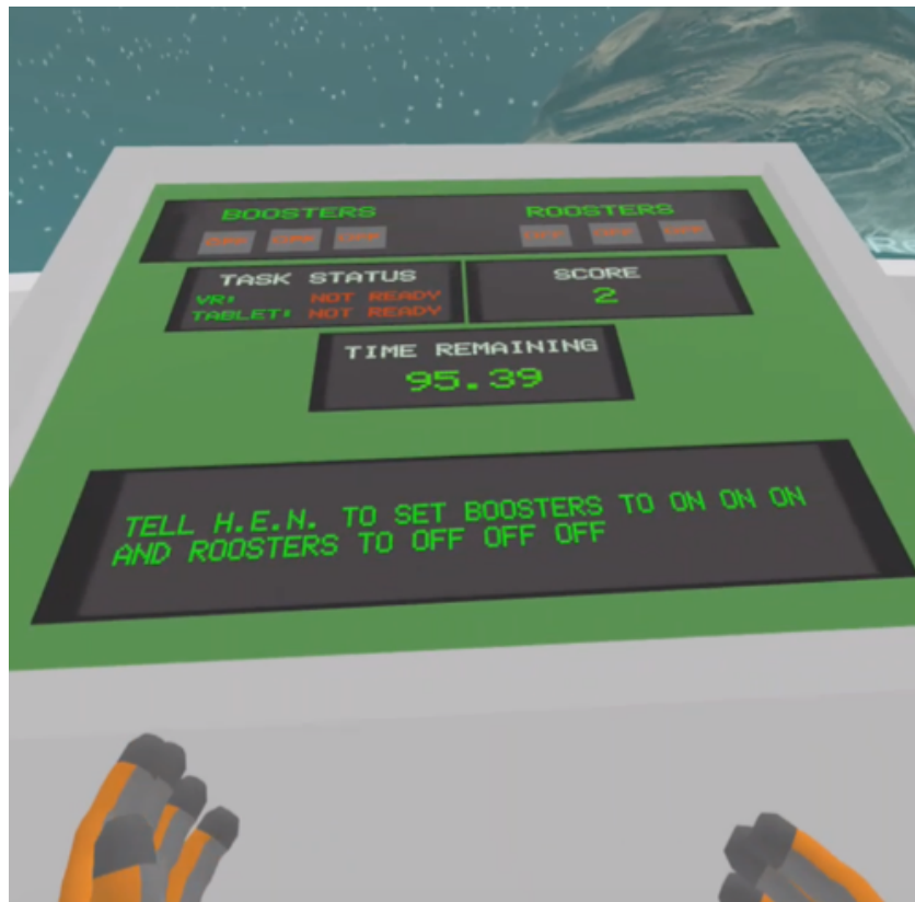
Figure 2 – The VR player's view