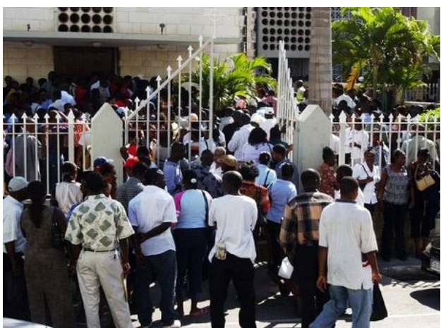
In this 2005 photo, The Jamaican Gleaner shows hundreds of farm-work applicants gather at the St Paul's

United Church in Montego Bay, St James, hoping to be selected for the programme (Redpath 2011)