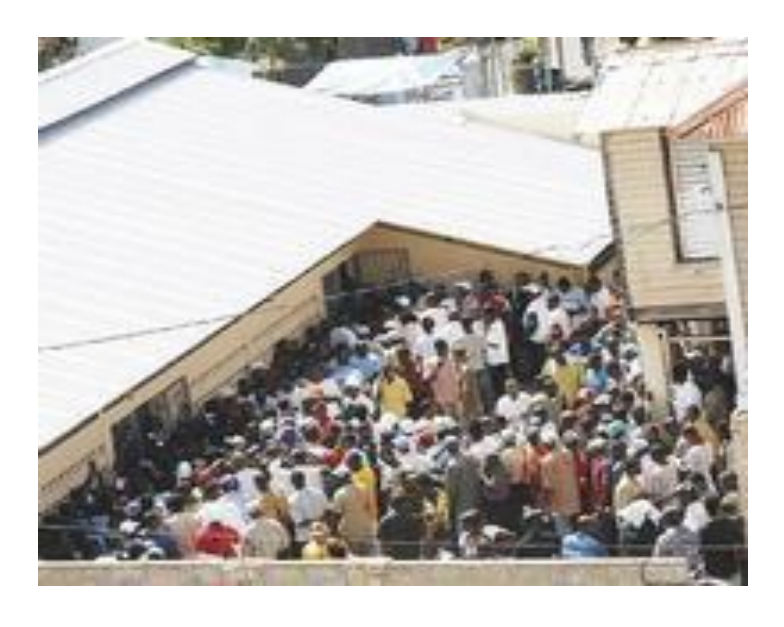
Scores of persons gathered at the Ministry of Labour and Social Security's Overseas Employment Centre at East Street, Central Kingston Jamaica, hoping to be chosen to participate in the Canadian Farm Work Programme. (Jamaican Observer 2006)

United Church in Montego Bay, St James, hoping to be selected for the programme (Redpath 2011)