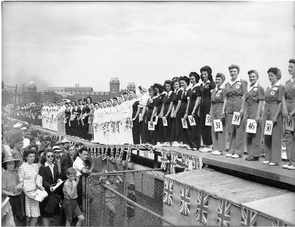
Figure 1. The Miss War Worker Beauty Contest, 1942