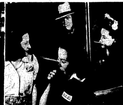
TIRED GIRL WORKER is only half a producer. She was up late and needs a rest, and her work will suffer. Government urges all workers: "Don't be cheated in sight of the nation's goal—victory." Soldiers at the front can't rest on the job.