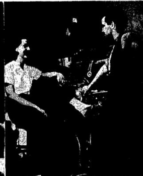
WHEN 100 WORKERS waste five minutes each, a day's work is lost. Specially posed pictures on this page were issued by Canada's Wartime Information Board.