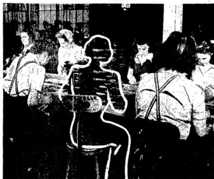
"GIRL WHO ISN'T THERE" represents a serious bottleneck in Canada's production of vitally needed war materials on many far-flung fronts. Worker absent because of illness, or absenteeism, means a gap in the front line, too.