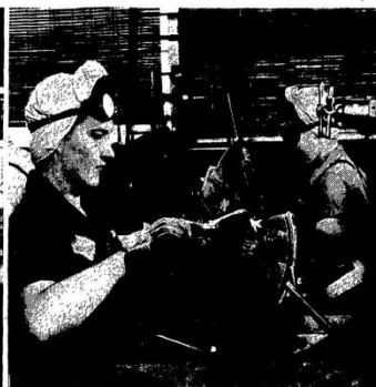
WEAR THOSE GOGGLES—An accident may cheat the worker of sight, lose a skilled worker for a war plant. Carelessness, officials maintain, is a serious form of inefficiency in munitions plants.