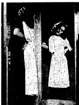
DRESS HAS COST some fighting men a gun. Taking a lay off to go shopping is declared to be "absenteeism in its most appalling form," shows disregard for responsibilities.