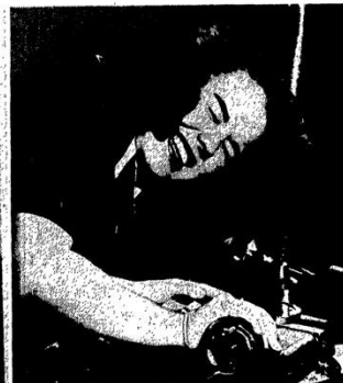
REGULATION BANDANNA would have saved this girl from a painful "scalping," perhaps worse. Factory rules are made for workers' safety and comfort, should be followed faithfully.