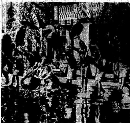
INTO THE POOL leap the girls of the Women's Auxiliary Army Corps holding empty barracks bags over their heads. As they hit the water, the bags are brought down sharply, filling them with air for use as emergency lifebelt substitutes