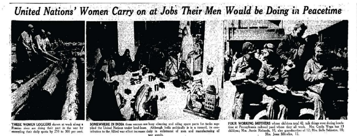
Figure 2. "United Nations' Women Carry on at Jobs Their Men Would be Doing in Peacetime", Toronto Daily Star , April 27, 1943; page 21.

Furthermore, when the women's pages praised women's performance within traditional male-dominated labour, such as in railroad yards or in the active service, coverage tended to remind readers that these wage earners were still wives and mothers and grandmothers. For example, in Figure 2, the women's pages of the Toronto Daily Star presented images of Russian, Indian and American women working in logging and in railroad yards as well as manufacturing war goods, heralding these women as exceeding productivity expectations at "jobs their men would be doing in peacetime" (21). Specifically, one of the photos depicted "four working mothers" who, combined, have 42 children, including grandchildren. In much the same way that the Canadian nurses 'stood by the [male] troops' in the aforementioned article, so too was the paid labour of women in other nations negotiated in relation to the men in their lives—literally and symbolically—and, concomitantly, in relation to their domestic roles and its associated qualities. This reminded readers that women were wives and mothers and grandmothers first. They were wage labourers second, working hard on-the-job to support their men and "[do] their part in the war" (Ibid. 21). Women's identity, including their workplace identity, was bound by their lives in the home.