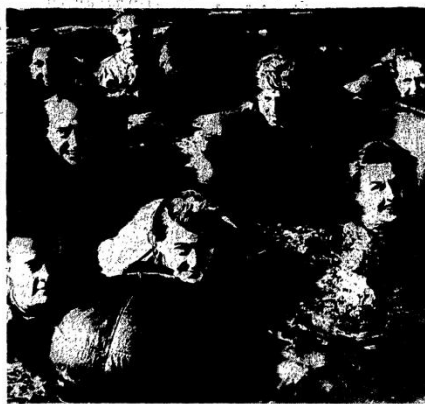
USING INFLATED BAGS as giant water wings, the army girls race each other in a swim across the pool. All the girls taking the refresher course—and it is refreshing—hold the rank of third officer in the Women's Auxiliary Army Corps