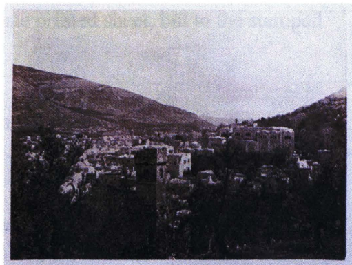
fig. 2 "Shechem (Nablous), Between Ebal and Gerizim," Mounted albumen print, #590, from F. Frith's Photo-Pictures of the Lands of the Bible . (n.d.)

Both images appear to be taken from the same or a very similar vantage point, but clearly were not taken at the same time. This is shown in photograph from the portfolio (fig. 2) by the construction of a second floor on a building located in the middle distance, as well as the completion of a stairwell on another building situated to the right of the foreground tower. Also, the foliage on the trees in the foreground is different in the two