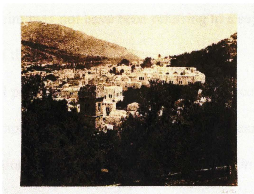
fig. 1 "Nablous: Ancient Shechem", mounted albumen print, plate 3 from volume one of the Holy Bible (1862-63)."

A representative example of this phenomenon can be observed by comparing two images of the town of Nablus. Nablous: Ancient Shechem is plate 3, in volume one of the 1862-63 edition of the Bible (fig 1.); Shechem (Nablous), between Ebal and Gerizim , #590 is from the portfolio, (fig. 2)