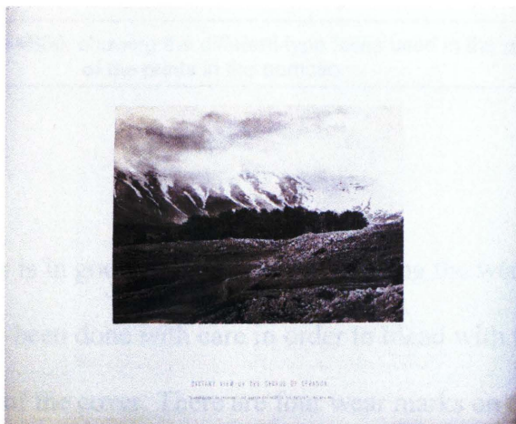
fig. 4, Example of a mounted albumen print from the portfolio showing the lithographed border and letterpress text

The fifty albumen prints, in both horizontal and vertical orientations, measure approximately 15.5 x 20 cm., in the portfolio. Each print is mounted on an oblong sheet of heavy board 38.2 x 30.6 cm. and of a cream colour. Each of the photographs is framed by a light grey lithographic border 21.2 x 26 cm. wide and is, as the portfolio title states, accompanied by "Scripture Words" printed in letterpress, centred below the print.