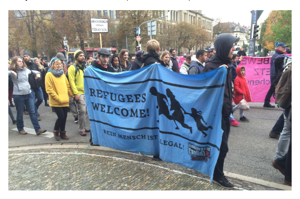
Figure 4: Pro-refugee protests in Freiburg, 2015

An effect of this support for refugees and the new policy directive was that the material, on-the-ground circumstances changed. In early September, 2015, large numbers of migrants and refugees arrived in Germany, particularly over the Austrian-Bavarian border. An estimated 20,000 refugees arrived in the Bavarian capital Munich in one weekend alone. There was a large outpouring of support for the refugees among the German population (Figure 4). People volunteered their time to assist the refugees as they arrived; children donated their toys; and Merkel spread optimism when she repeatedly said: "we can handle this" ( Wir schaffen das ).