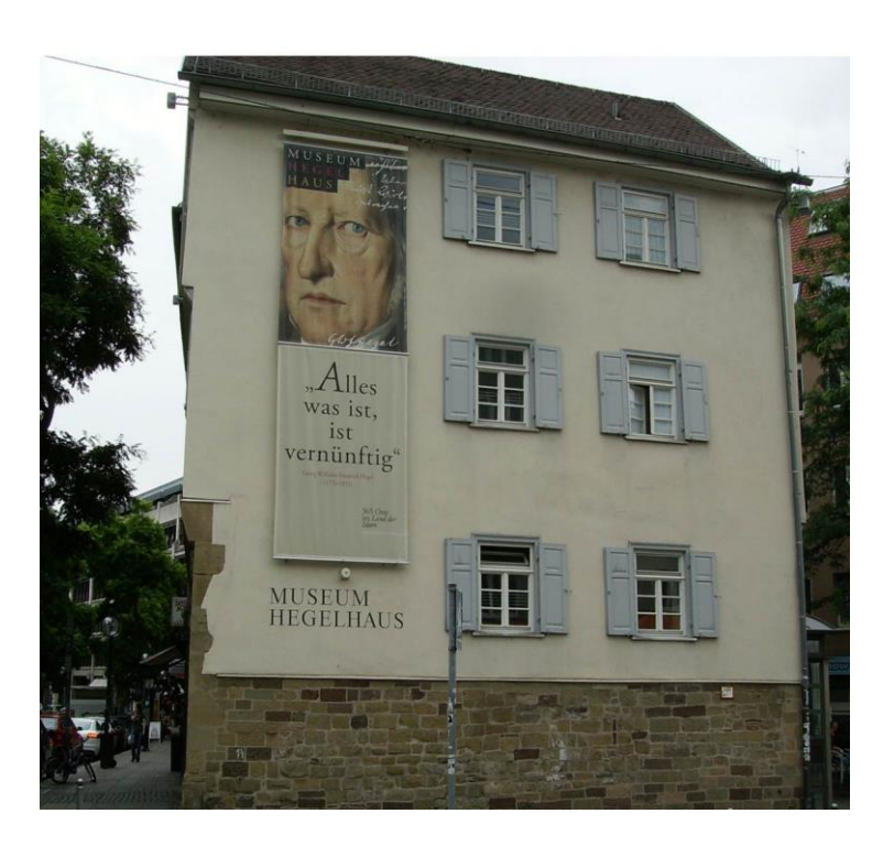
Figure 1: Hegel Haus in Stuttgart, Germany.

My interest in Hegelian dialectics was triggered when I lived in the German city of Stuttgart during a sabbatical a few years ago. Stuttgart is Hegel's city of birth. Figure 1 shows the house where Hegel was born, which has been converted into a museum, called the Hegel Haus .