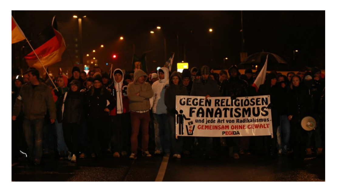
Figure 3: PEGIDA Demonstrations, 2014.

A key event, in my interpretation, was the emergence of anti-migrant "PEGIDA" rallies in Dresden, which began in October 2014 and quickly gained supporters (Figure 3). PEGIDA stands for Patriotic Europeans Against the Islamisation of the Occident ( Abendland ). Around that same time, there was an increase in arson attacks on refugee shelters throughout Germany.